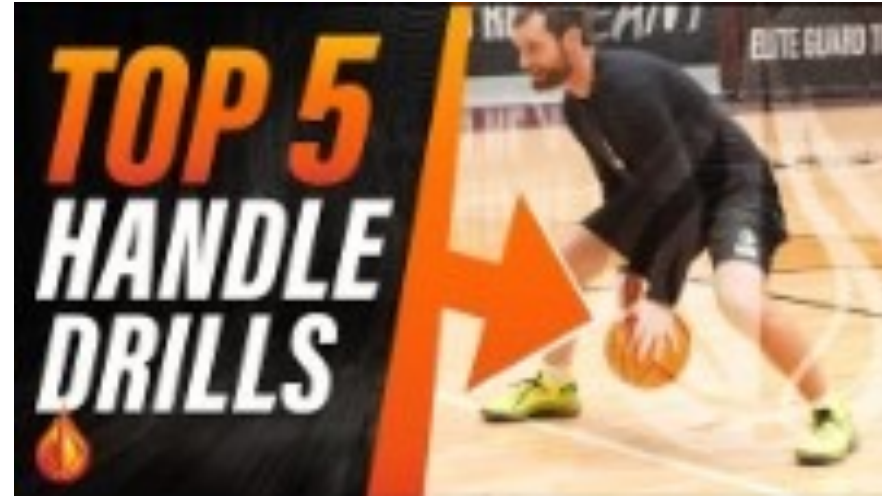
Channel: DeepGame Video: 5 Dribbling Drills EVERY Player Should Do