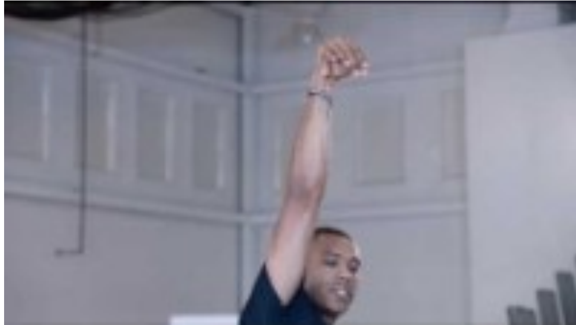
Channel: Jr NBA Video: Fundamentals Of Shooting