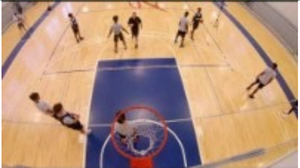
Channel: Jr NBA Video: Shell Drill 5-on-5 with Post