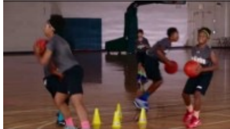
Channel: Jr NBA Video: 4 Corner Passing Drill