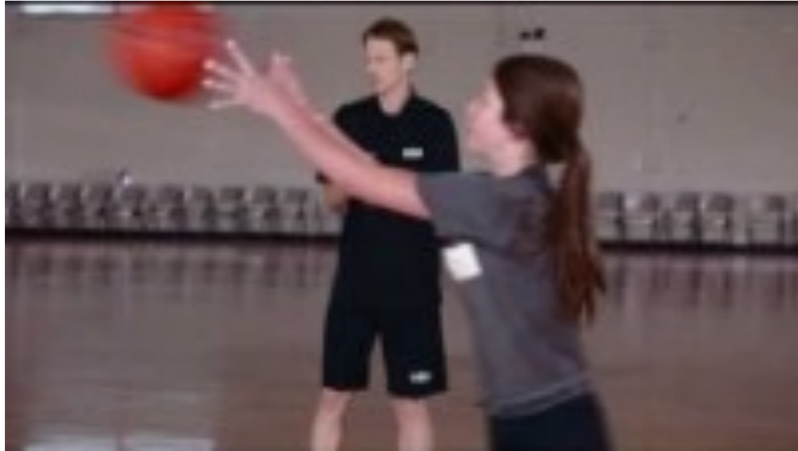
Channel: Jr NBA Video: Catch, Turn, & Shoot Drill