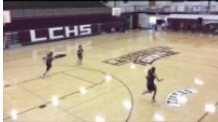
Channel: Brant Llewellyn 17146 Video: Perfection drill 3 man weave