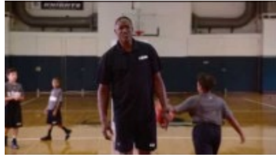
Channel: Jr. NBA Video: Chase Layup Drill