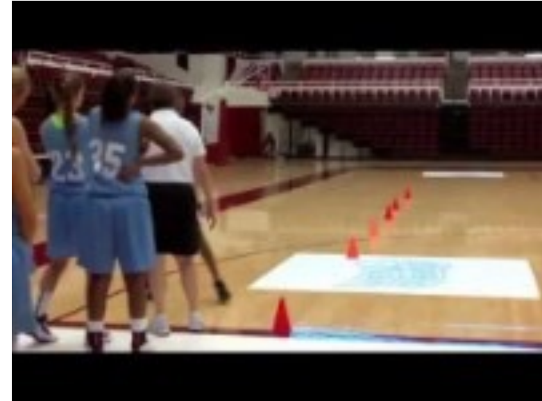
Channel: FastModel Sports Video: Defensive Drills for Youth Basketball