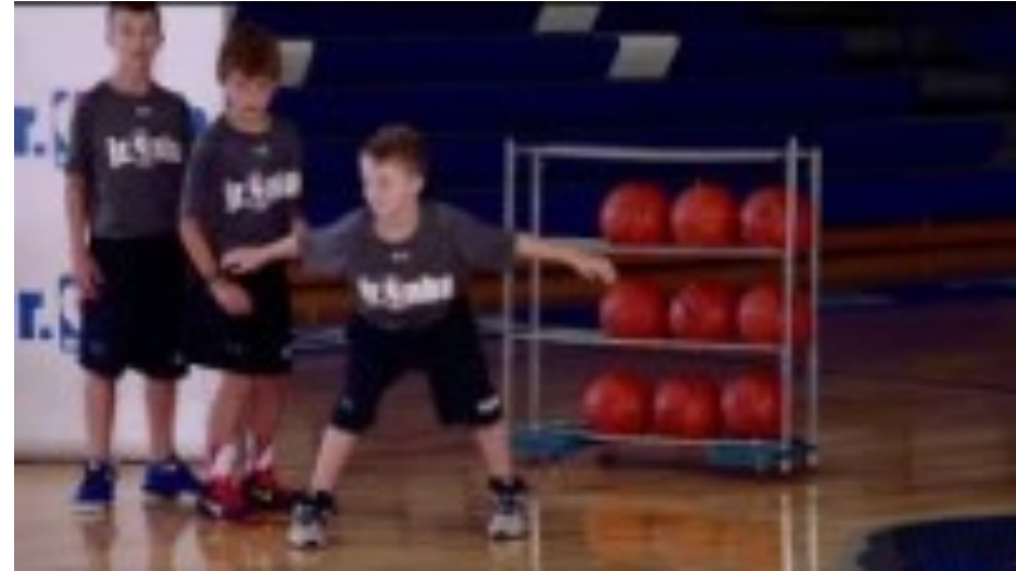
Channel: Jr NBA Video: 3-Second Box Out Drill