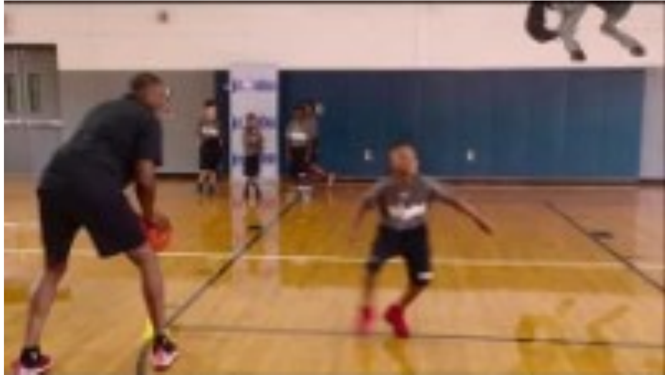
Channel: Jr NBA Video: Closeout, Slide, & Backpedal Drill