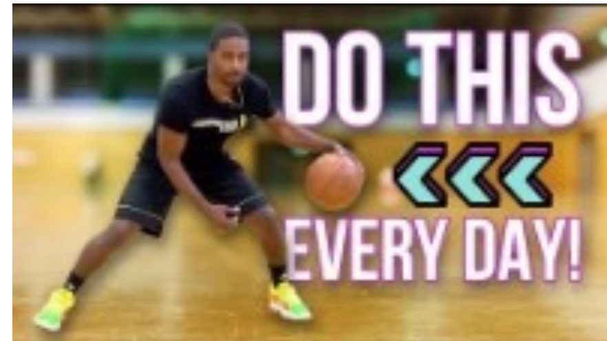
Channel: ILoveBasketballTV Video: This 5 Minute DRIBBLING WORKOUT Changes Your Game FOREVER