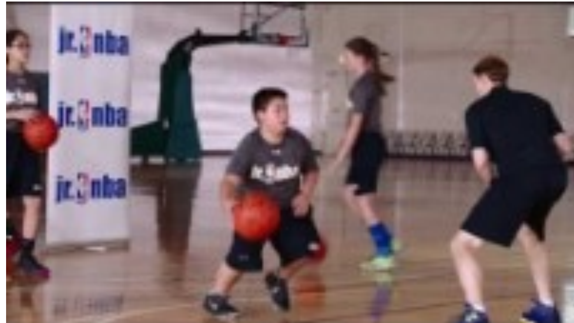
Channel: Jr NBA Video: In & Out Crossover & Shoot Drill