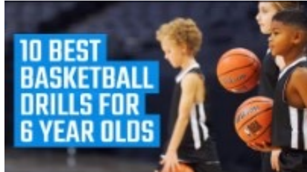
Channel: yougotmojo Video: Best Basketball Drills for 6 Year