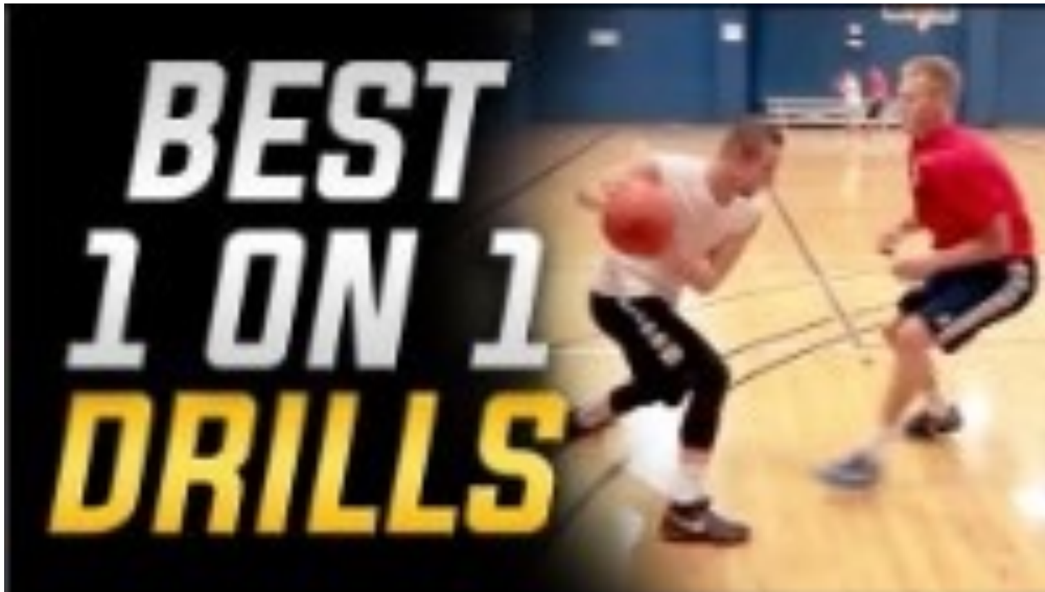
Channel: ShotMechanics Video: Best 1 on 1 Basketball Games